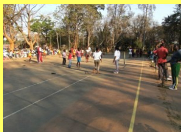
Children playing in bare feet

The letter and brief description of the project is included in this newsletter- some HLM's who were present at the lunch have very kindly donated some funds to help with the cost of the flights. If anyone else feels they would like to help, please contact me directly.