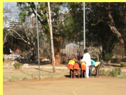
Drinks at half time- all round one tap