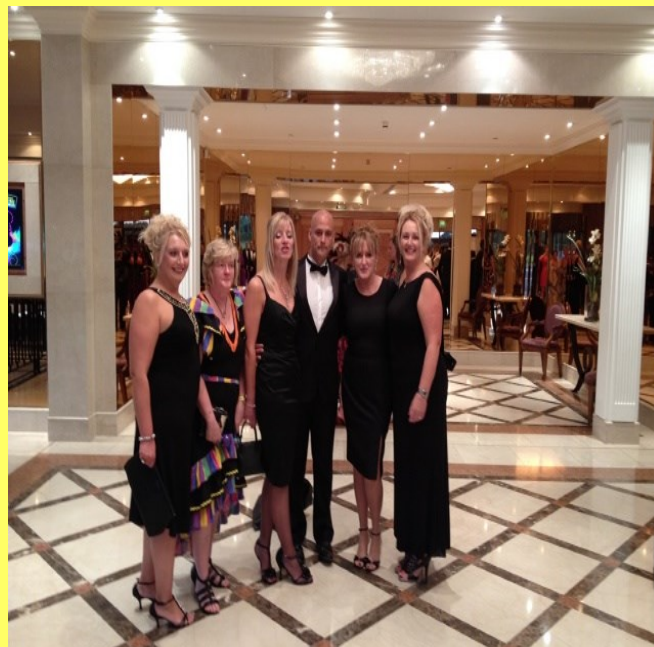
A Barbershop rendition of the HLM Anthem at the Goalden Globes?

When the pipes leak, when the bones creak When the knees go bad A simply remember my favourite things And then I don't feel so bad.