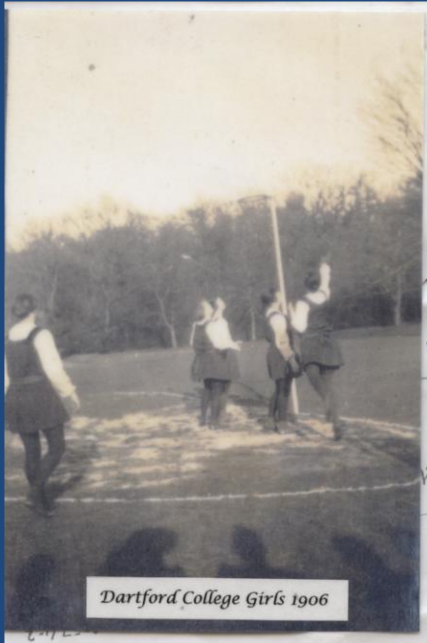
Dartford College Girls 1906