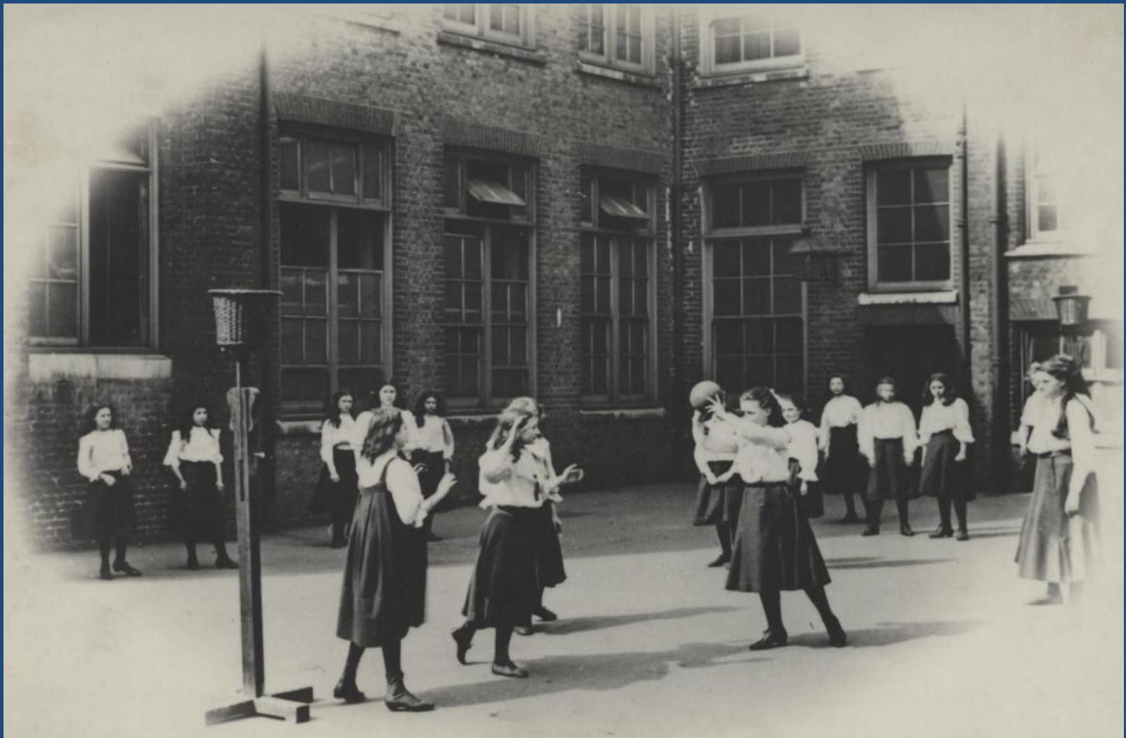
Baskets on posts