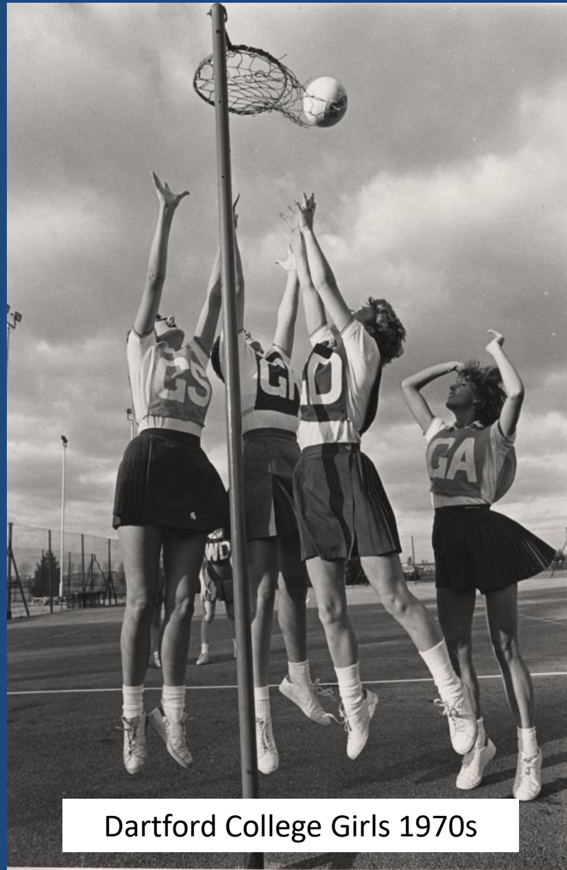
Dartford College Girls 1970s